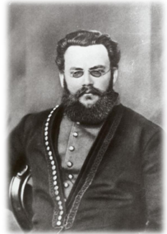
Writer Carl Robert Jakobson 1868